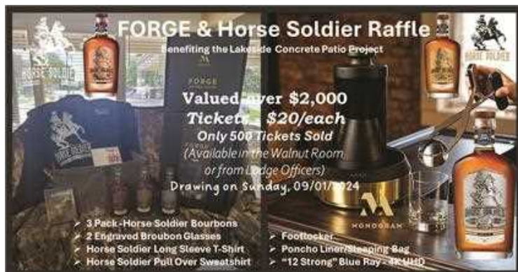
FORGE & Horse Soldier Raffle Benefiting the Lakeside Concrete Patio Project