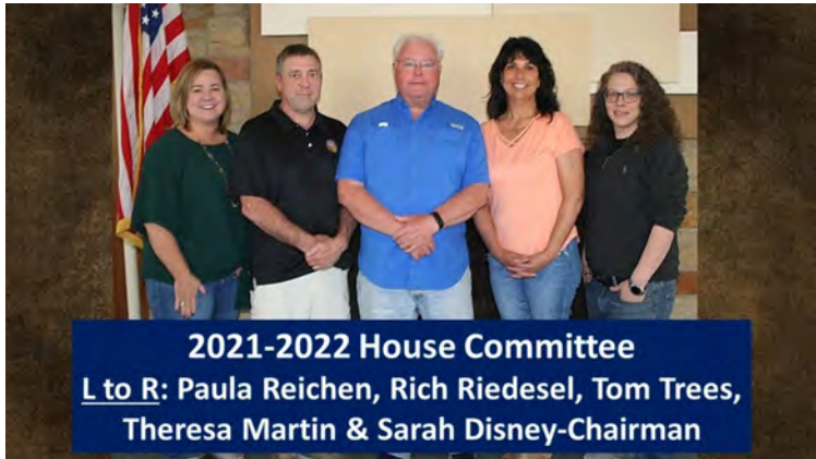
2021-2022 House Committee